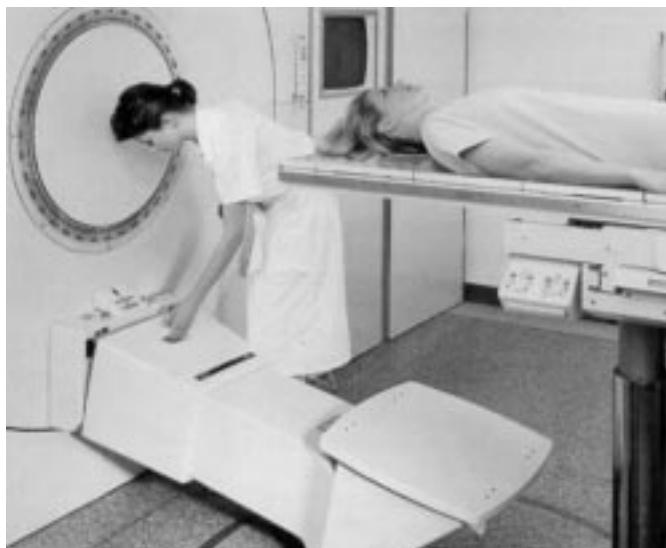
Figure 1. Electronic Portal Imaging Device (iView)

The main reasons for the compression radiotherapy and more generally medical images are transmission, storage and archiving costs (1). There are many algorithms for image compression: "lossless" which are fully reversible with no loss of data or "lossy" where there is a loss of data but the file sizes are smaller. The results of the compression of the scanned simulator radiographic film, and portal image obtained with Electronic Portal Imaging Device (EPID) (Figure 1) during the treatment with linear accelerator, are presented in this paper. There is an increasing demand for the implementation of radiotherapy imaging in routine patient treatment to obtain both the quality assurance of field alignment and documentation of actually given radiation treatments (2).