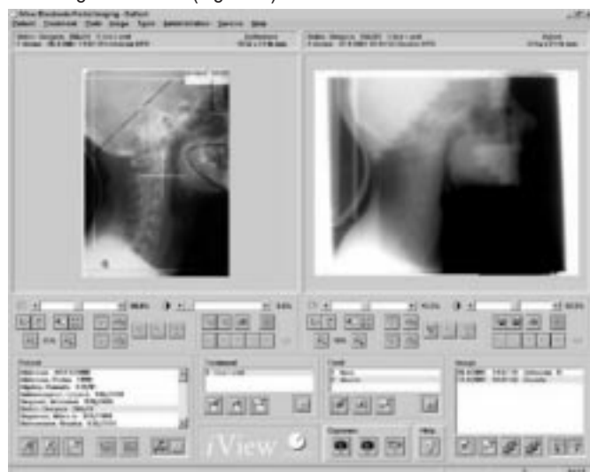
Figure 3. iView monitor layout: Referent and patient image

Patient images are stored by default as a standard 434 kB bitmap images - BMP (768x566 resolution). The iView supports many other common image formats including DT-IRIS, JPEG, TIFF, GIF etc. The high resolution images are displayed on iView's single 21" screen. Digitized simulator radiographic film served as referent image for EPID (Figure 3).