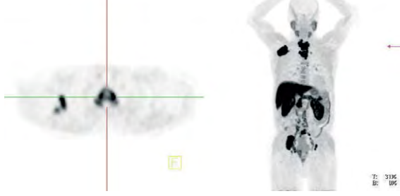
Figure 2. Multiple regions of 18F-Choline uptake in axial skeleton and paraaortic as well as iliac lymph nodes