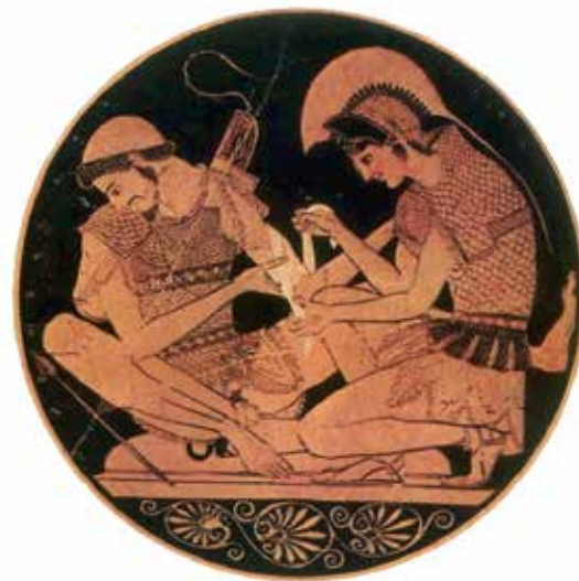
Figure 4. A cup by Sosias: Achilles bandaging the injured arm of Patroclus (vase displayed in Antikenmuseum, Staatliche Museen Preußischer Kulturbesitz, Berlin)

The earliest description of ancient Greek medical practice derives from the two epic poems attributed to Homer (47), the Iliad and the Odyssey, dated around the 8 th century B.C.E., presenting last parts of Aegean war against Troy. Surprisingly enough, among the poem lines there are descriptions of nearly 150 different battle wounds: injuries made by arrows and spears are with excellent anatomic description (Iliad XIII. 640-653) (48), 31 lethal head injuries (48,49, 50, 51). The procedures of healing and care giving are also recorded. Medical care among Greek warriors was organized by professionals. One of the art healing masters was Machaon, the son of the legendary Asclepius. He was very skilled in taking up the arrows and healing the wounds (48). The soldiers were educated to help themselves and also to help each other (Figure 4). They cleaned the wounds with wine (Iliad XI. 638) (48), and bandaged them with certain herbs. In military surgery, many scientific rules were applied and it comprised systematic observation. Surgical procedures were always accompanied by prayers and magic (52).