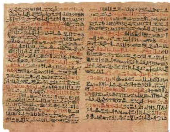
Figure 3. Edwin Smith's Papyrus: Plates VI and VII (displayed at the Rare Book Room in New York Academy of Medicine)

Surgical supply was very useful and practical. A famous relief on the wall of the temple at Kom Ombo Temple shows about 40 different medical instruments (Figure 3). These include speculums to open the vagina and rectum for internal examinations, containers for holding solid and liquid medicines, forceps, dental tools, suction cups, hooks for special spreading open incisions and wounds, and curettes for scraping away infected tissue. Surgical tool also included knives, drills, saws, hooks, scalpels, retractors forceps and pinchers, scales, spoons and a vase with burning incense (25, 27, 40, 41).