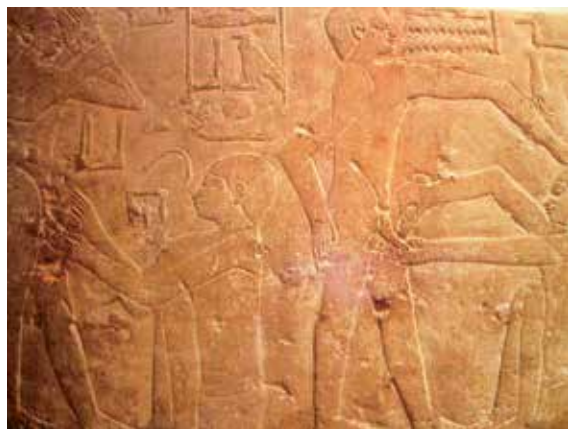
Figure 1. Adolescents in ritual circumcision, Tomb of Ankh-Mahor, Saqqara – Egypt

According to the wall inscription from the Old Kingdom (2635-2155 B.C.E.) anatomy was very well understood and dissection of human body was a common procedure. The amputation or deep surgery were avoided for the rules that the body must not be disintegrated, for the whole body is necessary for the afterlife. Circumcision was an exception to this rule, the Egyptians, like other ancient peoples recognized the importance of circumcision. The world's first known picture of a surgical operation, carved on the wall of a tomb of Ankh-Mahor at Saqqara around 2250 B.C.E. shows doctors performing a circumcision (Figure1)(21). According to Herodotus, Egyptians were the first to circumcise children and it was practiced for reasons of hygiene (22). The ancient Jews may have learned the surgical technique of circumcision from Egyptian civilization; and circumcision is the only surgical procedure mentioned in the Old Testament (23).