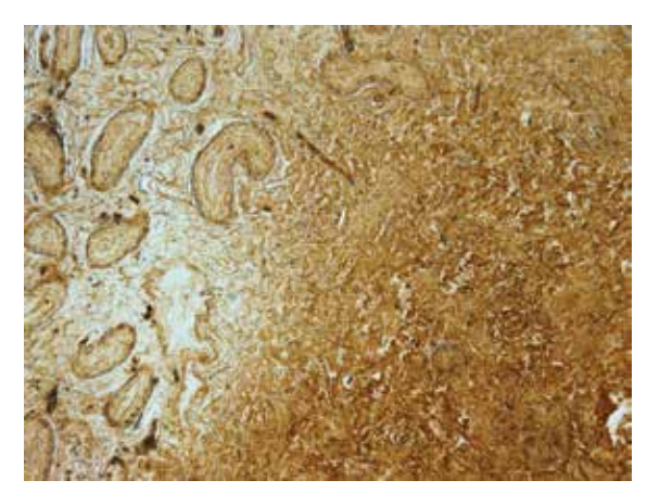
Figure 3. Left: Normal testicular parenchyma. Right: Tumor parenchyma with hyalinised binders and capillaries, (Gomory x 5)