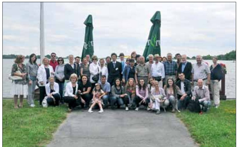
Participants of the 16 th Academy of Studenica (The Palić Lake)