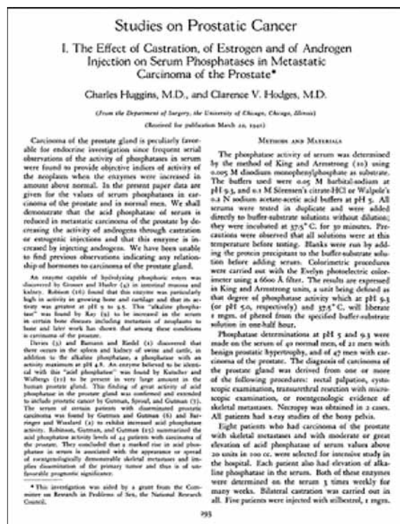
Figure 1. Facsimile of the original paper of Huggins and Hodges which became a cornerstone of hormonal therapy of prostatic carcinoma