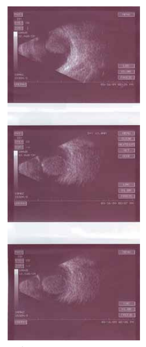
Figure 2. Ultrasound of the right eye

were regular. But, on the fundus of the right eye a solid, globular mass could have been observed. The mass was spreading towards the vitreous body, down and partially nasal. Around this mass was a shallow ablation (Figure 1). The ultrasound of the right eye verified prominent solid mass, 11 mm thick, mildly high, and partly diluted reflection, with intense reflex of the surface. Translucency was seen towards the base, which was narrower. A shadow in the orbit was partly seen in the projection of the basis of the lesion (Figure 2).