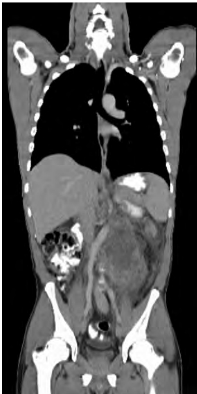
Figure 1. Large solid mass displacing the bowel, aorta, and IVC to the right

The MRI of the brain revealed cerebral metastases with hydrocephalus for which he had cerebroperitoneal shunt (Figure 2).