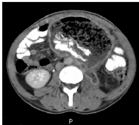
Figure 3. CT abdomen shows air fluid level with contrast in the abdominal mass with areas of solid component

His chest CT scan was normal however his abdominal CT scan showed incomplete resolution of the abdominal mass with fluid and air level (Figure 3).