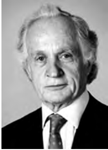
Mario R. Capecchi,

born 1937 in Italy, US citizen, PhD in Biophysics 1967, Harvard University, Cambridge, MA, USA. Howard Hughes Medical Institute Investigator and Distinguished Professor of Human Genetics and Biology at the University of Utah, Salt Lake City, UT, USA.