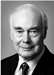
Martin J. Evans,

born 1937 in Italy, US citizen, PhD in Biophysics 1967, Harvard University, Cambridge, MA, USA. Howard Hughes Medical Institute Investigator and Distinguished Professor of Human Genetics and Biology at the University of Utah, Salt Lake City, UT, USA.