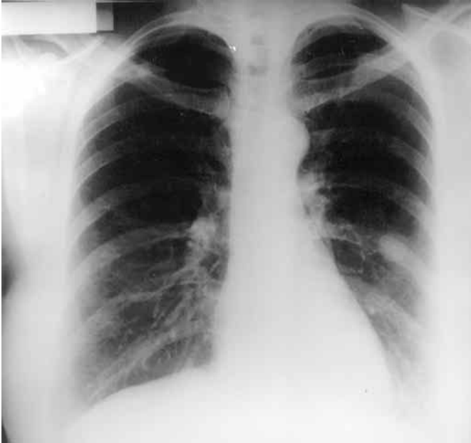
Figure 2. Lung metastases before chemotherapy